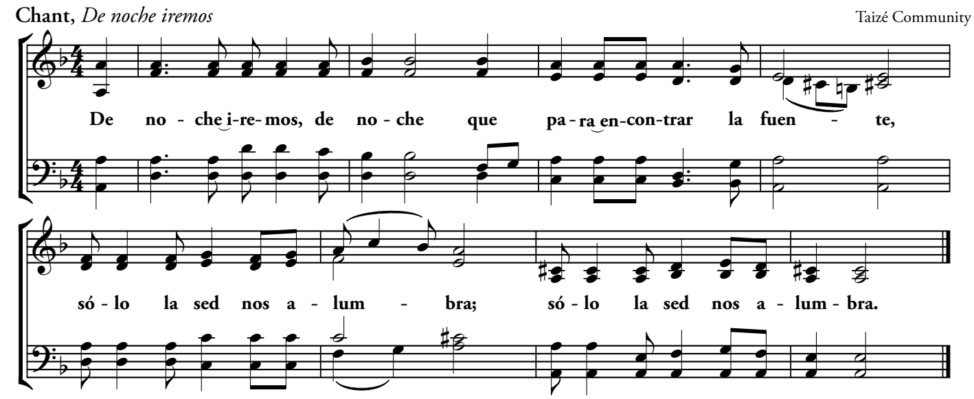
By night, we hasten, in darkness, to search for living water, only our thirst leads us onward.

Sicut cervus desiderat ad fontes aquarum, ita desiderat anima mea ad te, Deus. As the deer longs for springs of water, so longs my soul for you, God. —Psalm 42:1